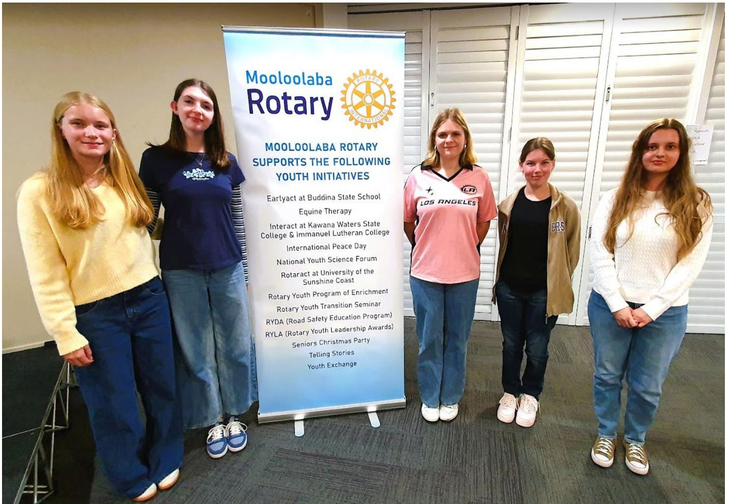
Guest speakers with our new banner supplied by Sunquest Signs